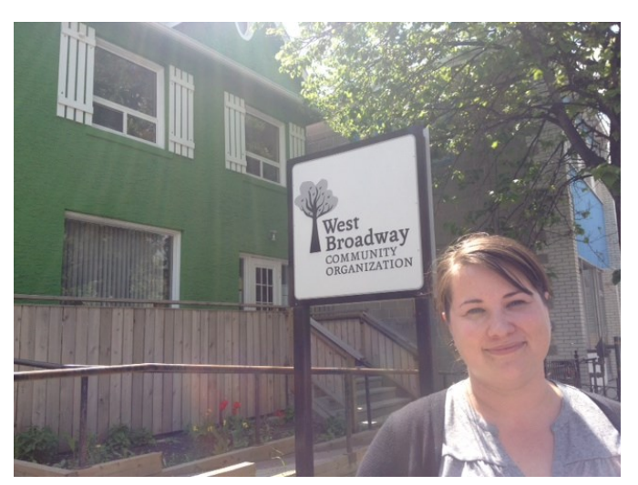
Jovan Lottis Rooming House Outreach

Working with landlords to create positive relationships with tenants