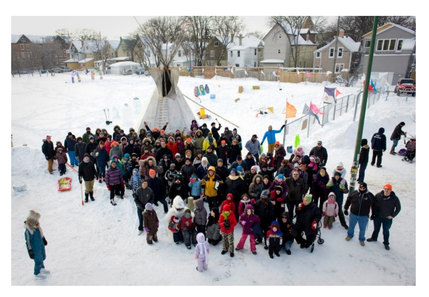
2012-13 Annual Report