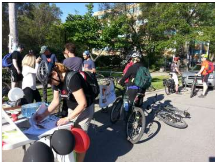
Bike To Work Day and WB Active Transportation Survey Kiosk