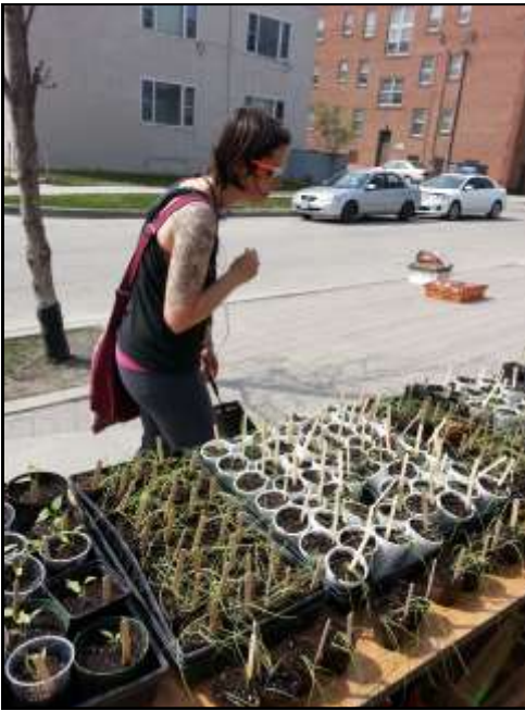
Huge Spring Plant Sale 2016