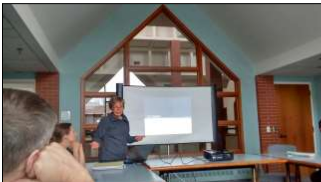
Downsizing & Decluttering workshop Downtown/Point Douglas Healthy Aging Resource Team