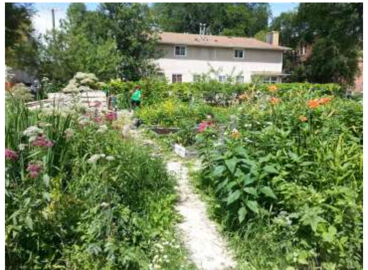
Spirit Park in full bloom after revitalization efforts in 2015—2016