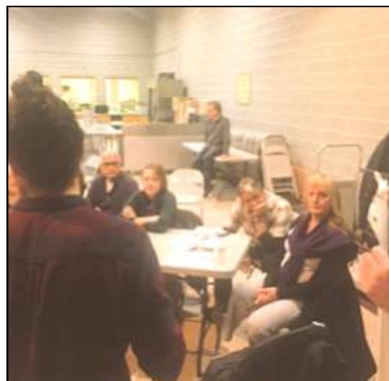
Community Plan Workshop 2016