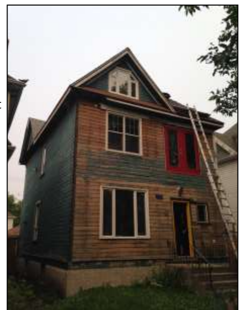
Property Improvement Program At Work 2016