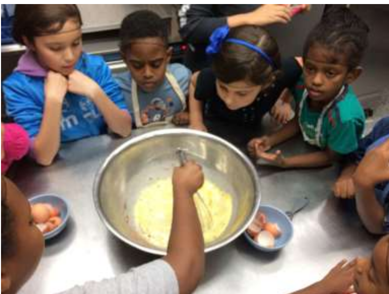
Kids Cooking Class

Neighbourhoods Alive!, the Winnipeg Foundation, the Graham C. Lount Family Foundation, Local Investment Toward Employment, Assiniboine Credit Union, the YMCA, Manitoba Community Services Council, MAFRA, Healthy Living Manitoba, Healthy Together Now, Buys Family Farm, Broadway Neighbourhood Centre, Crossways in Common, and the hundreds of GFC members and volunteers who make the Good Food Club great.