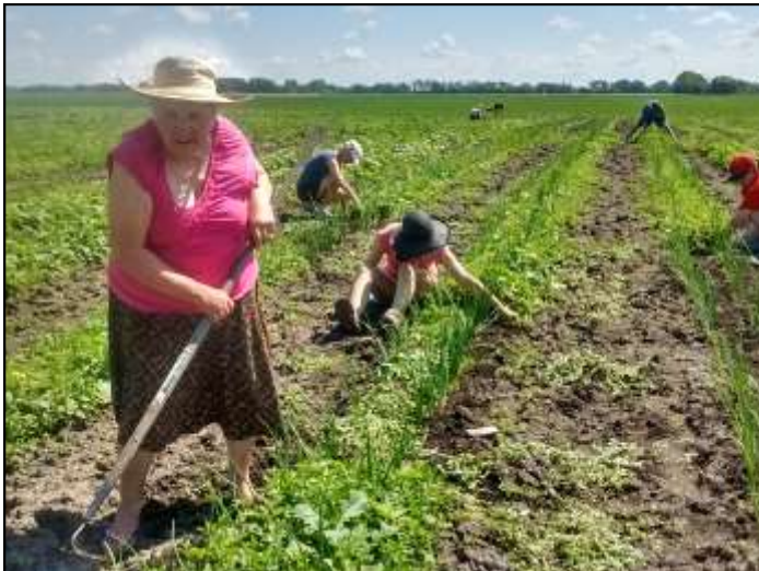
Good Food Club Farm Trip Summer 2016