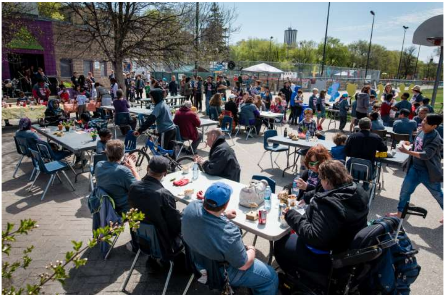
2017 Annual Spring Clean-up