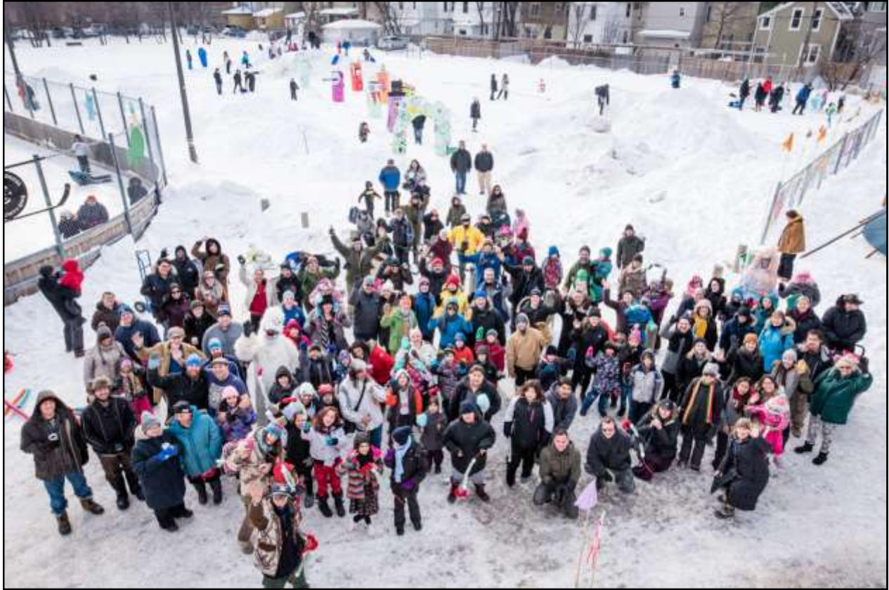
Annual Snoball Winter Carnival