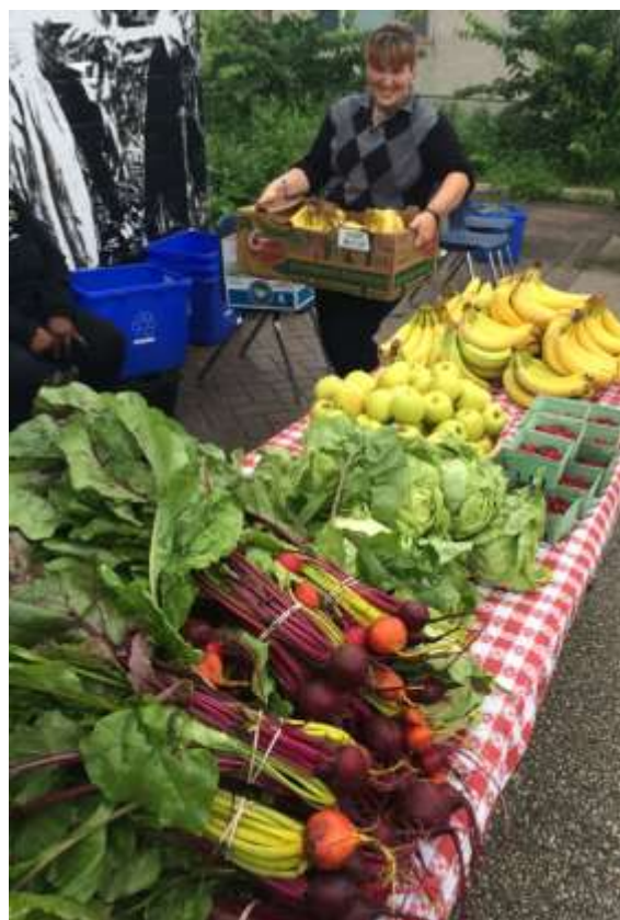
West Broadway Farmers' Market