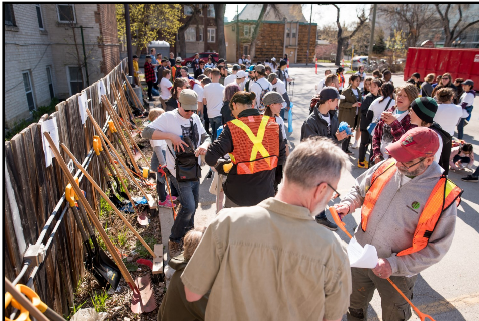
West Broadway's Annual Spring Clean-up