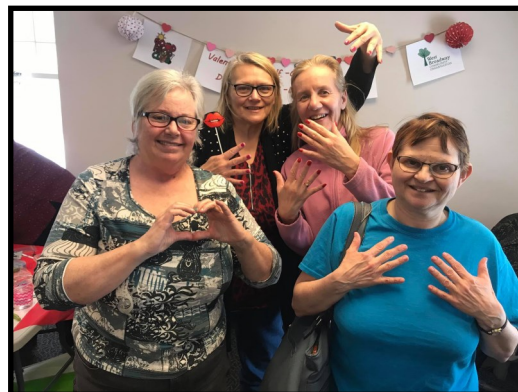
Valentine's Day Self-Care Self- Love Event