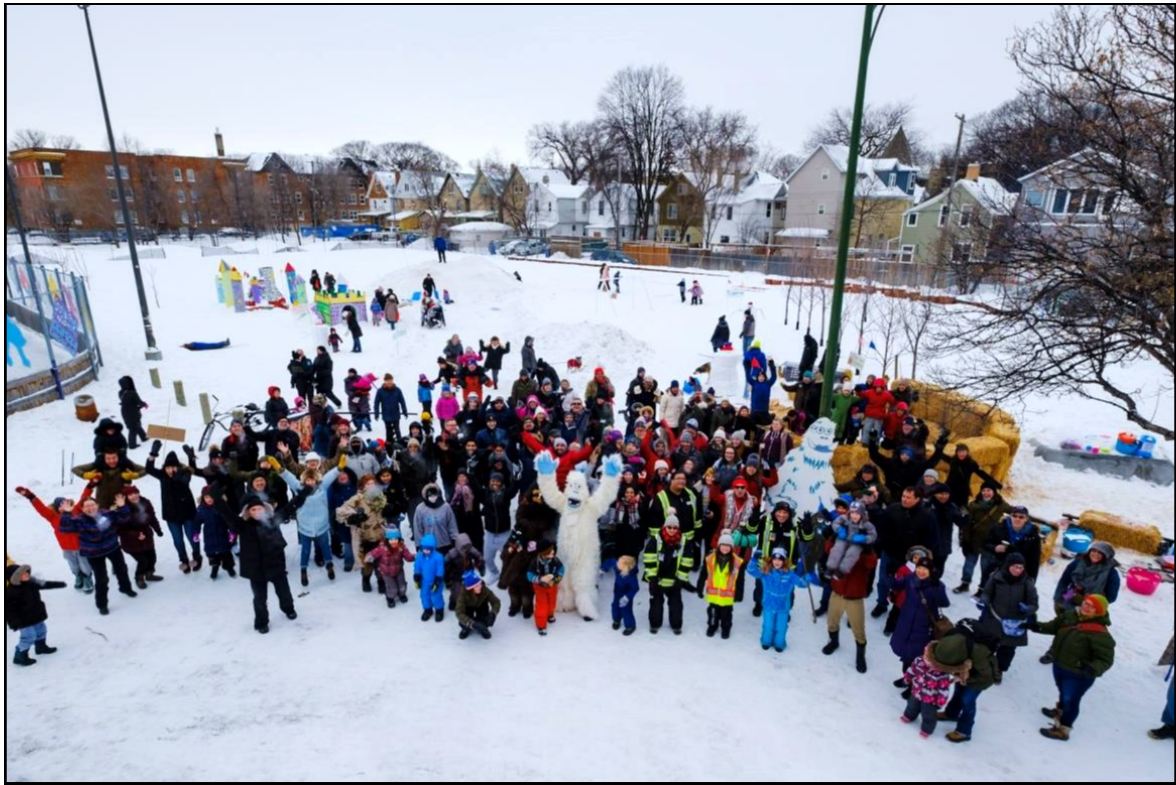
Annual West Broadway Snoball Winter Carnival