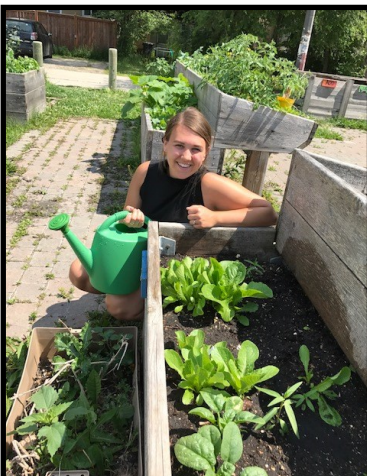
Garden Workshop at BNC