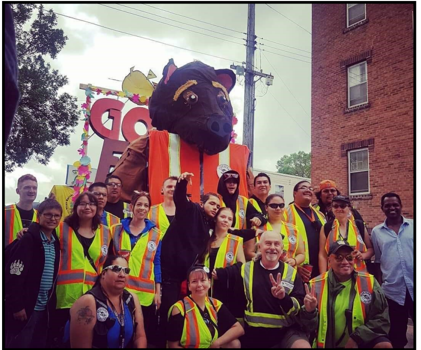
West Broadway Bear Clan in the Art City Parade