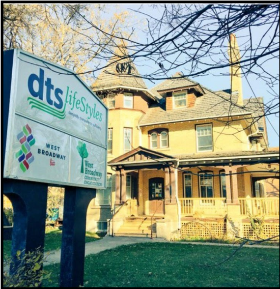
Our new sign at 545 Broadway