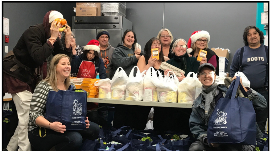
GFC's 'LITE Holiday Hamper Drive'