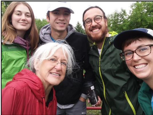
GFC Farm Trip Summer 2018