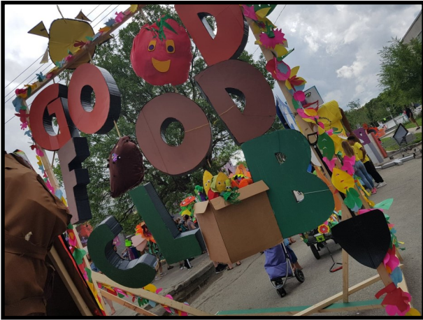
Good Food Club in the Art City Parade