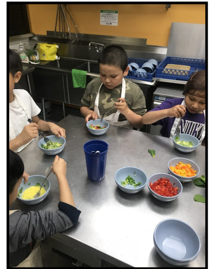
Kids at GFC Kids Cooking