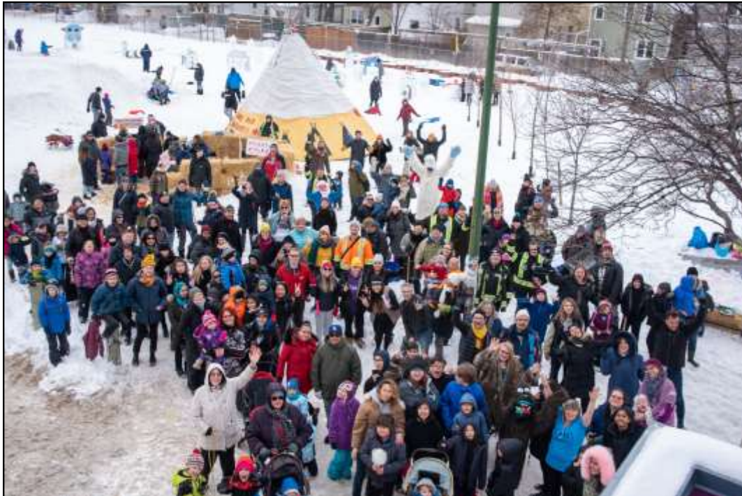
Annual West Broadway Snoball Winter Carnival