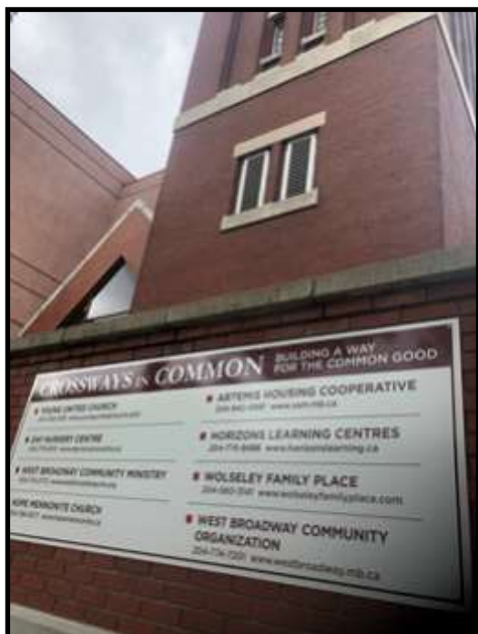
New WBCO offices At 222 Furby St