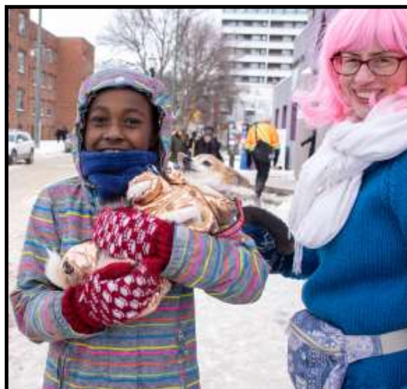
Snoball attendees and Coordinator