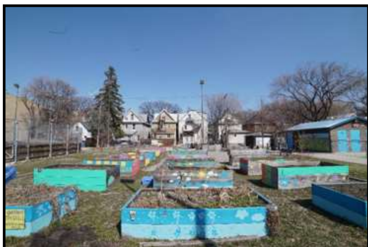
Freshly Painted Garden Boxes at Good Food Garden (Thank you Art City!)