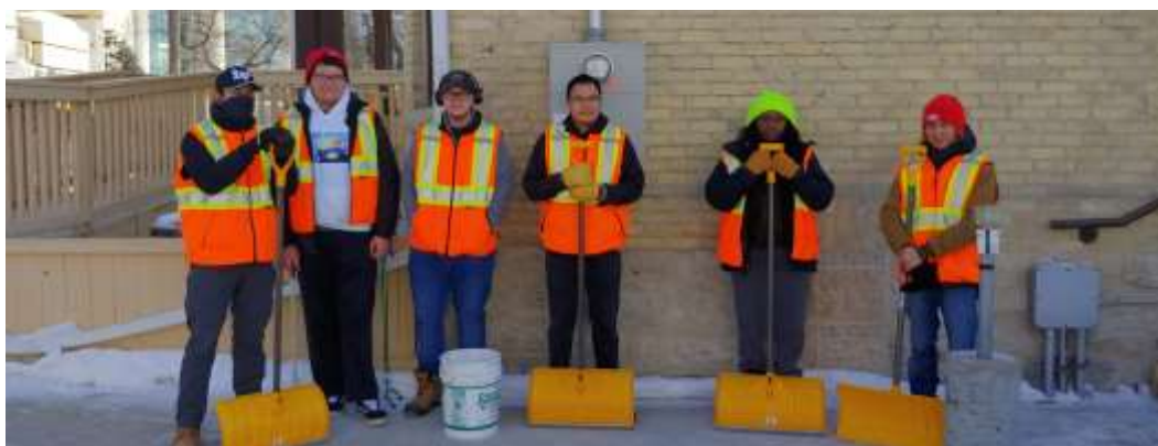
West Broadway Snow Team