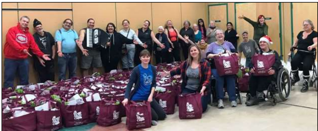
Good Food Club's 'LITE Holiday Hamper Drive'