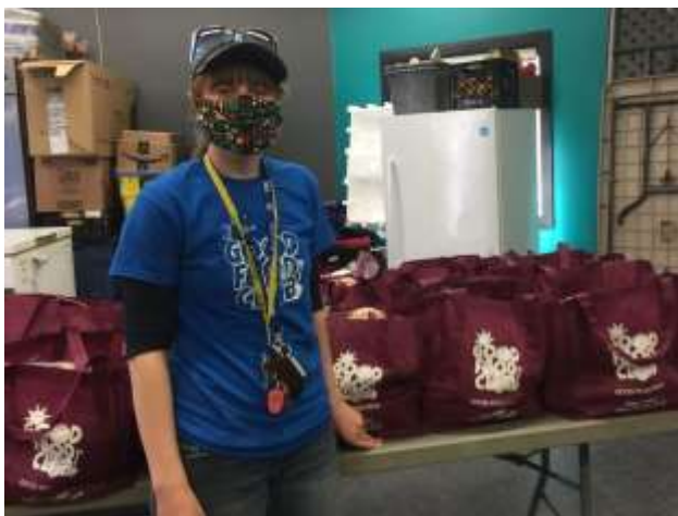
Good Food Club COVID19 Hamper Project