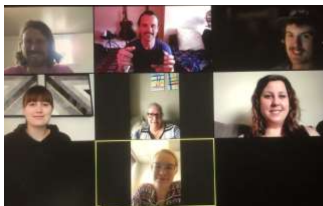
WBCO Staff Meeting During COVID19