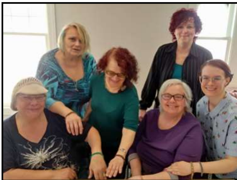
West Broadway Beading Group