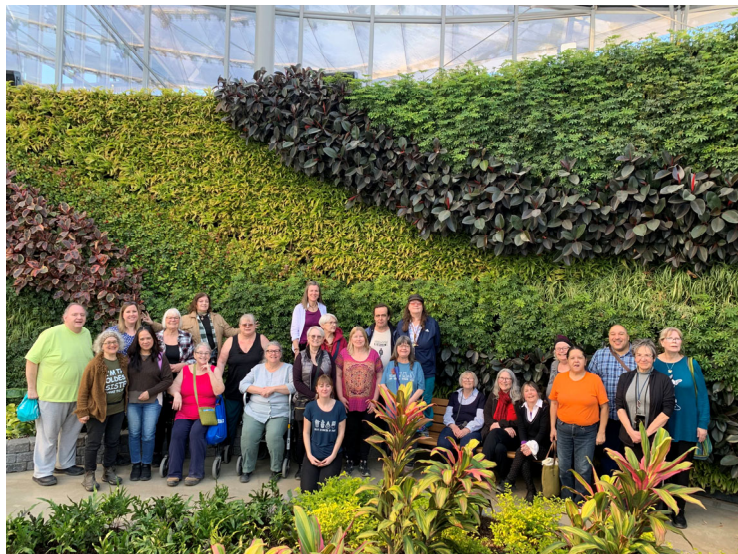
GFC Seniors and Friends visit The Leaf