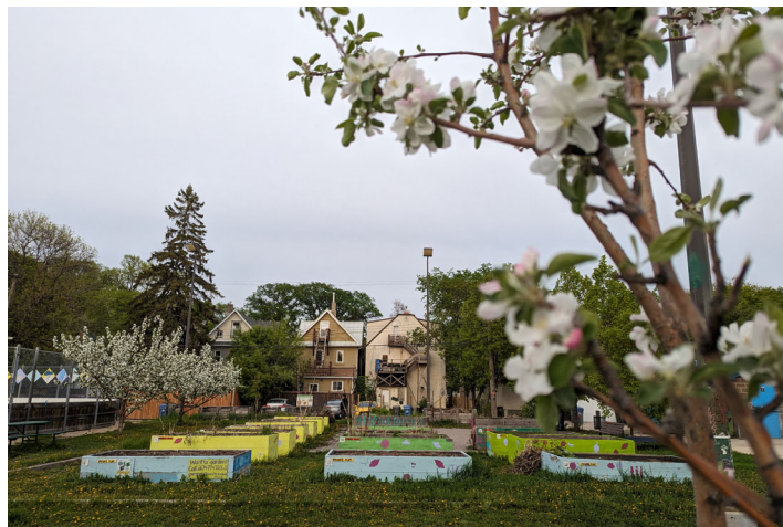
Good Food Garden and the Community Orchard