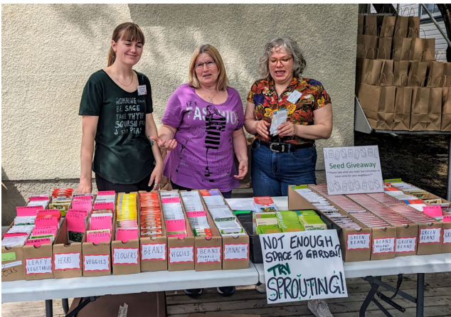
Spring Seed Giveaway at WBCO Open House