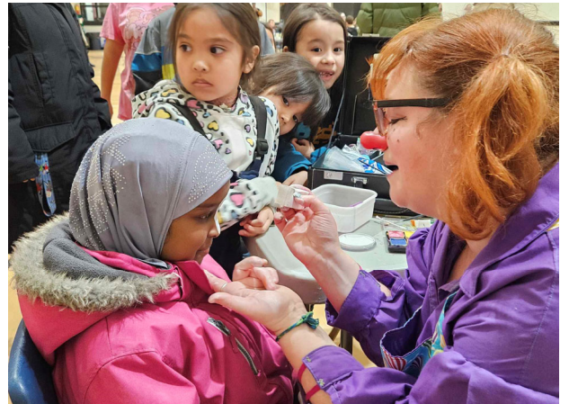
Face painting at Snoball 2024