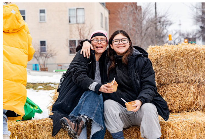
Fire-side at Snoball 2024