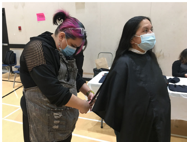
Free haircuts at Valentine's Day Self Care 2023