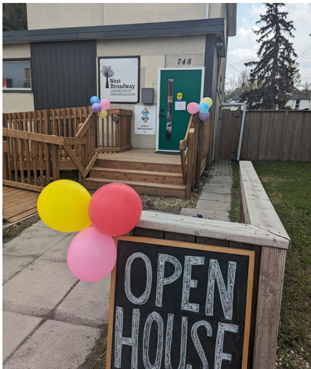
Open House at new location-748 Broadway