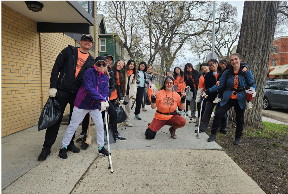
Community volunteers at the 2024 Spring Clean Up