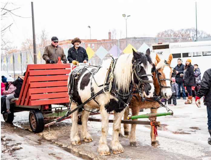
Horse drawn wagon rides at Snoball 2024